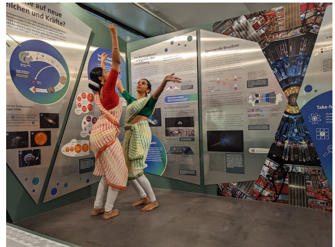
Dance your Science: illustrating proton-proton collisions in the Science Pavilion UZH.